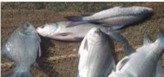
Figure: 2. Fish sample collection from the study site

Field surveys and fish sampling were conducted from January 2026 to April 2026 at regular intervals to observe seasonal variation in fish diversity and distribution.