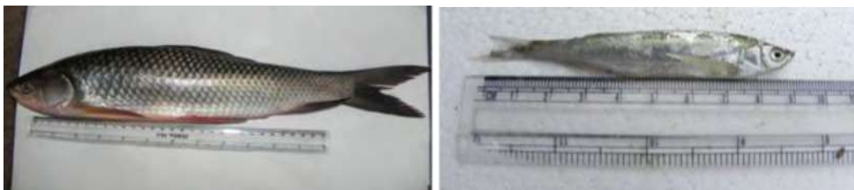
Figure: 3. Measurement of Fish for Morphometric Analysis

Morphometric measurements including total length, standard length, head length, body depth, and fin length were recorded using measuring scales and digital calipers. Meristic characters such as fin rays and lateral line scales were also examined for accurate species identification (Jayaram, 2010).